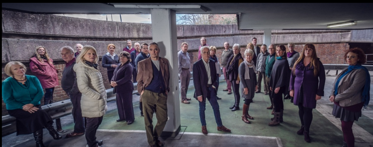
Salisbury Chamber Chorus - the little choir with the big sound