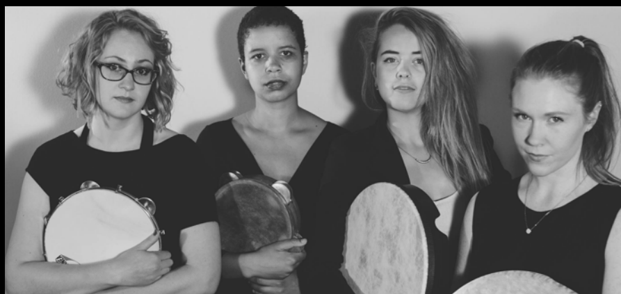
Beaten Track Ensemble

'A vast pattern of which I am a part...'